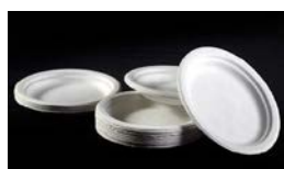
Plate (paper white D21.5 cm), 20 pieces